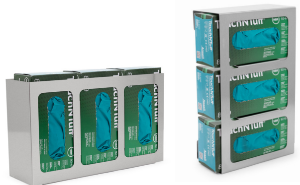
Mounts Horizontally Or Vertically