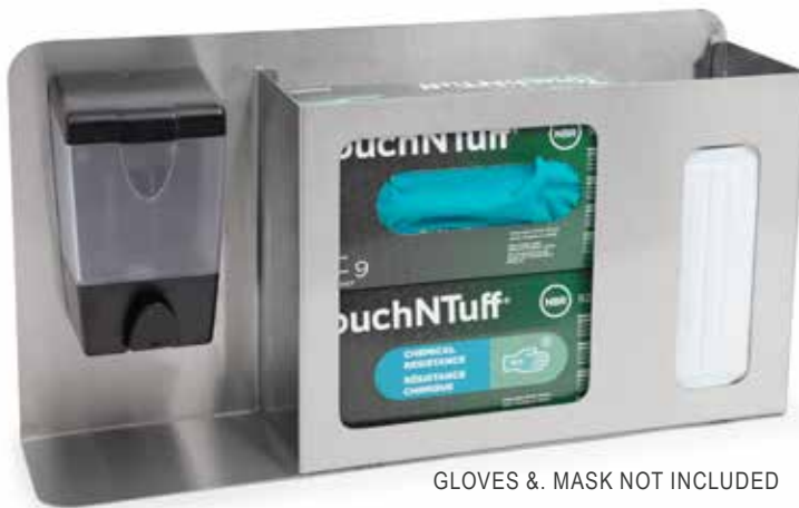
GLOVES & MASK NOT INCLUDED