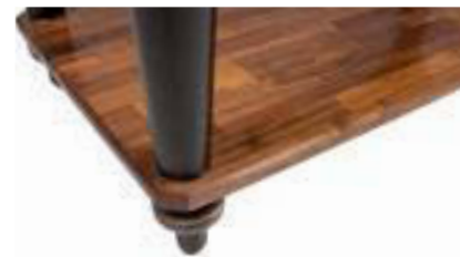
LOWER WALNUT SHELF