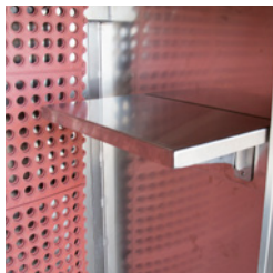
FOLD DOWN CHEMICAL SHELF